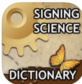
Signing Science Dictionary in American Sign Language