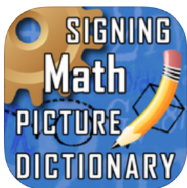
Signing Math Picture Dictionary in American Sign Language