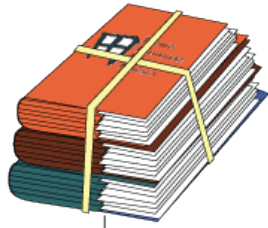
TIAN Bundle #3