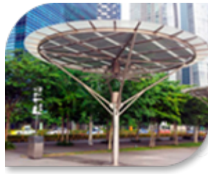
WIND Powered Fans for Parks