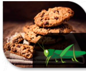
Food Made From CRICKETS