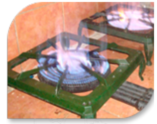
BIOGAS For Cooking